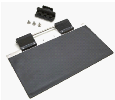
Holder Kit „2 plates“ vertical/horizontal Art.-No.: 150197-23